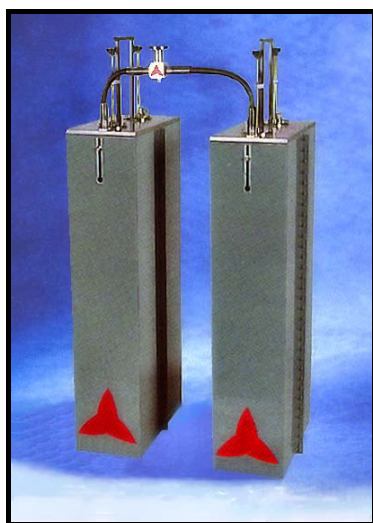
DC*200W / DC*1KW